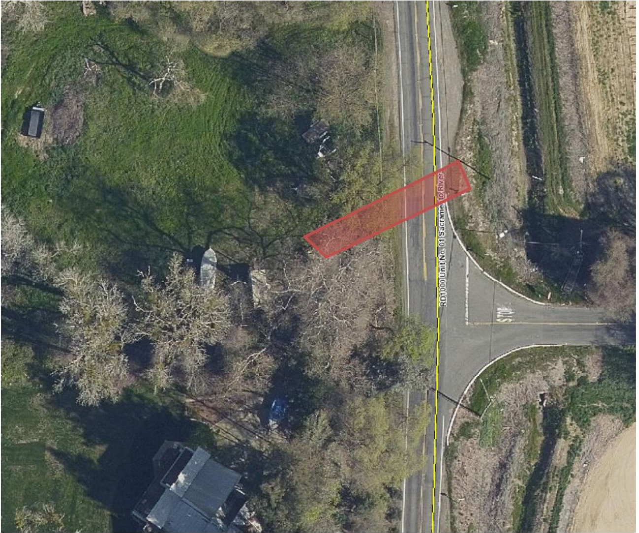
3) Approximate project footprint map